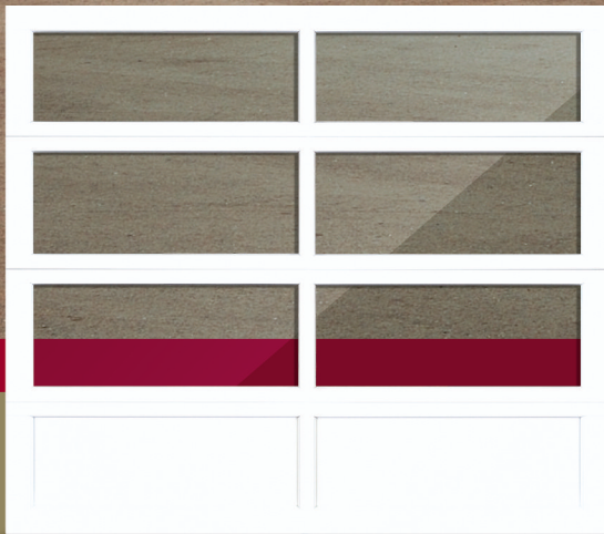
8' x 7' 3295, white full-view sections and solid bottom